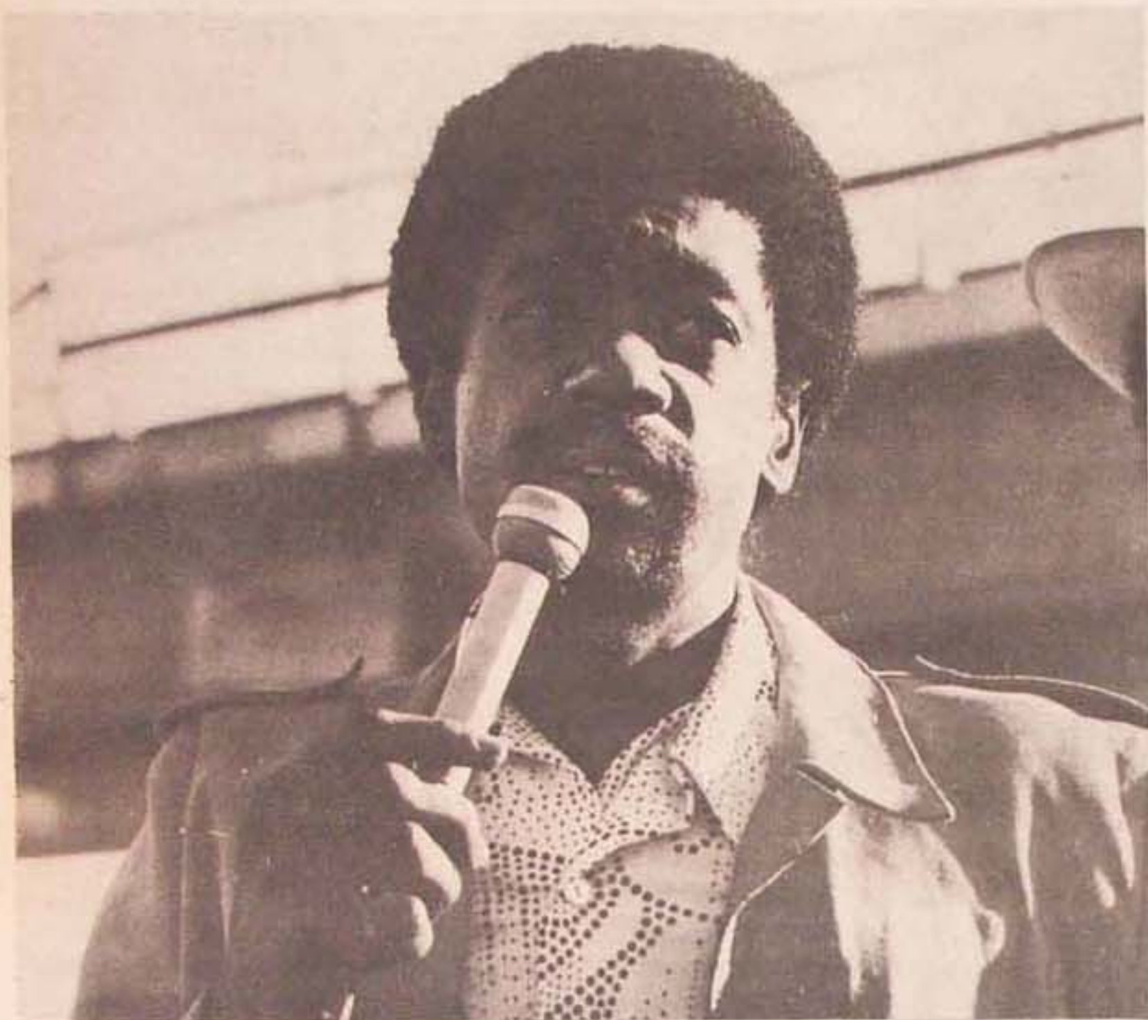
CHAIRMAN BOBBY SEALE