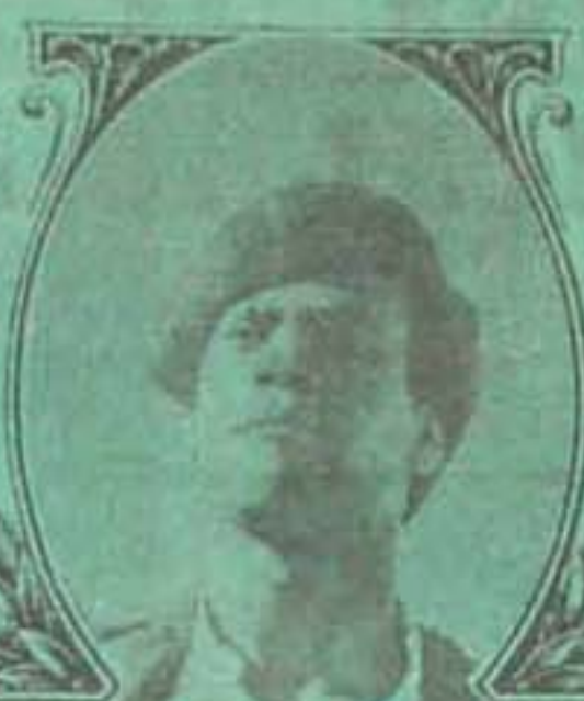
HUEY P. NEWTON