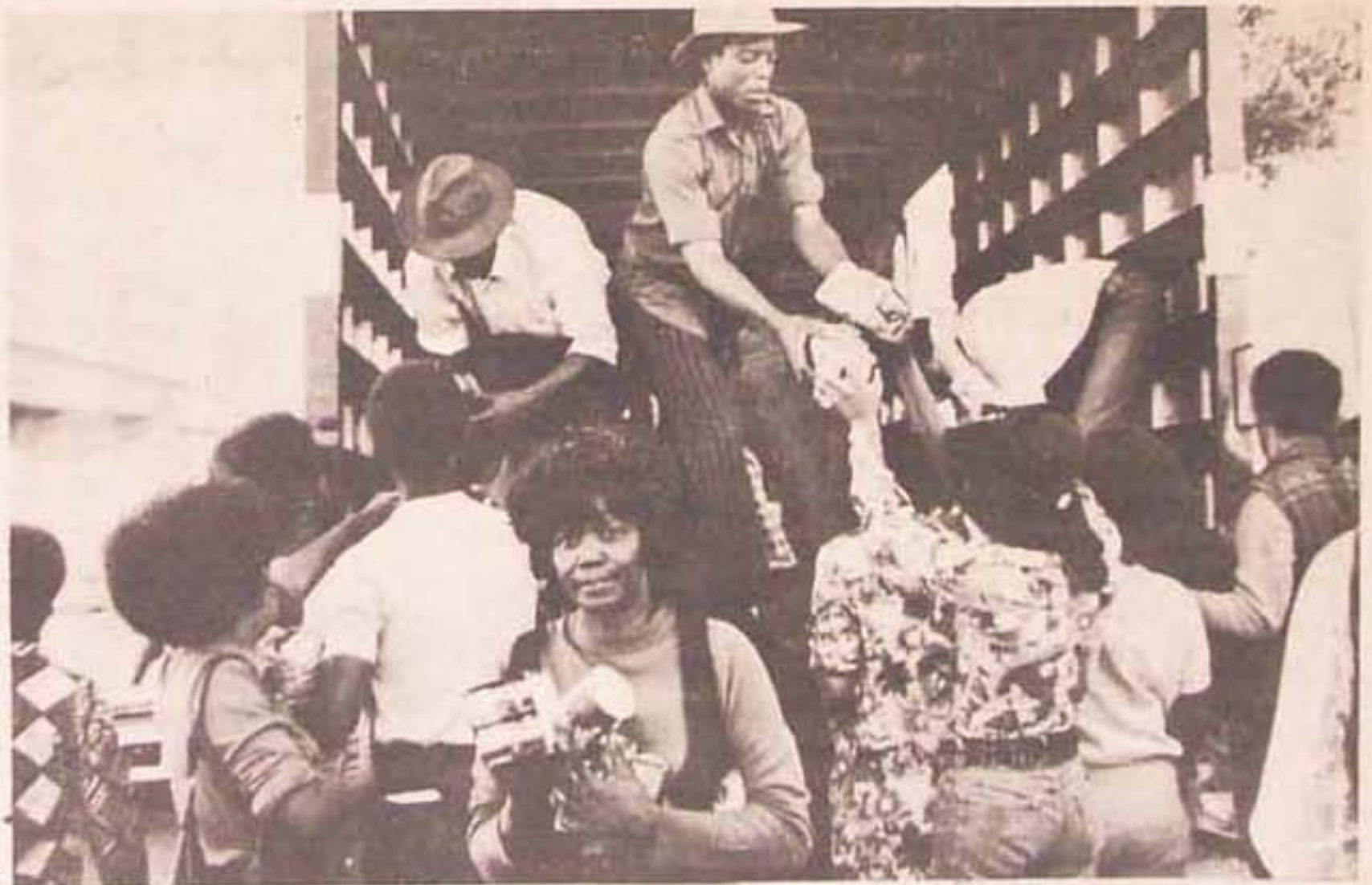
The People's Survival Programs are a good thing

son, Fleeta Drumgo and John Clutchette; those brothers have got to be set free.