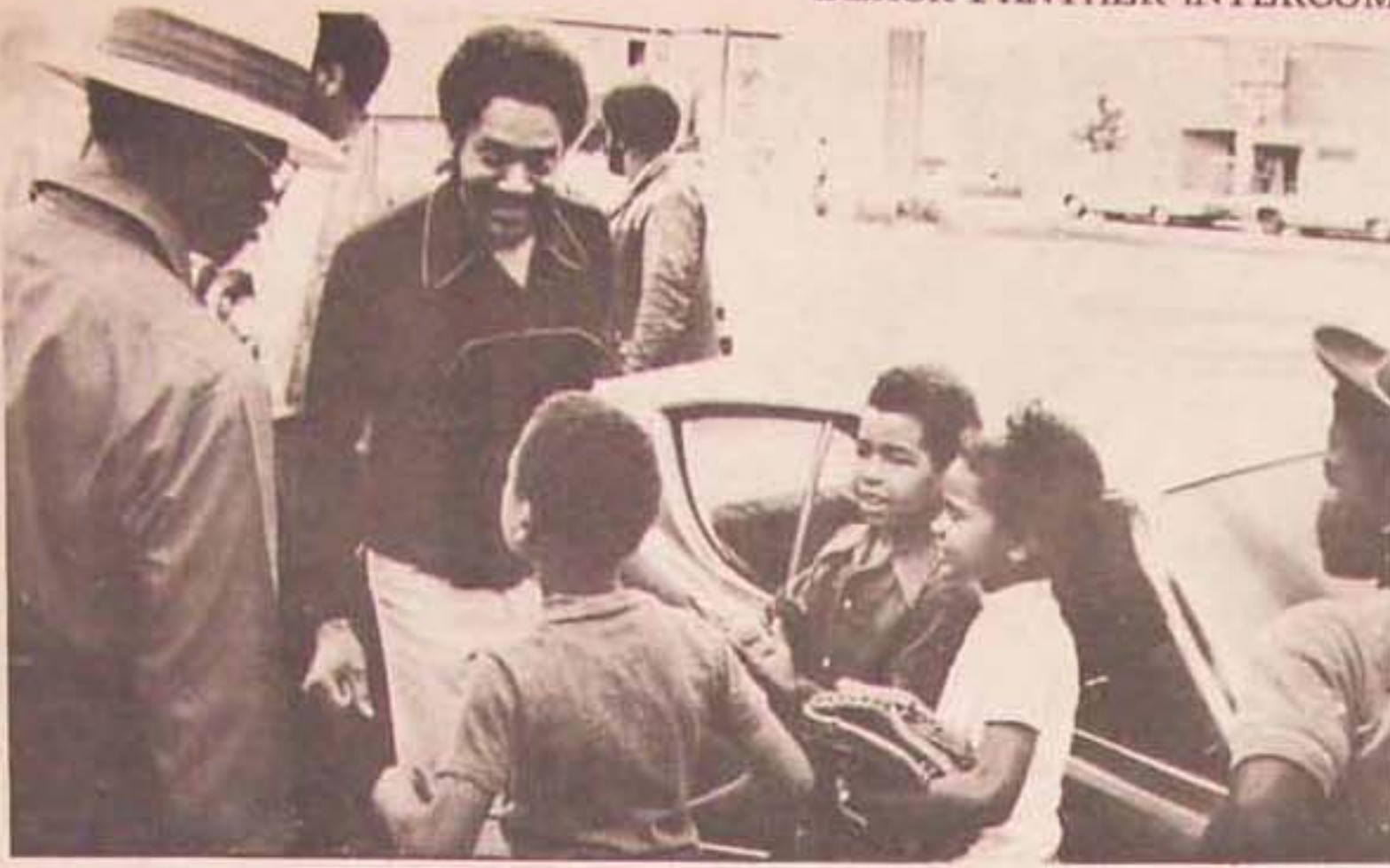
We want unity in the Black Community