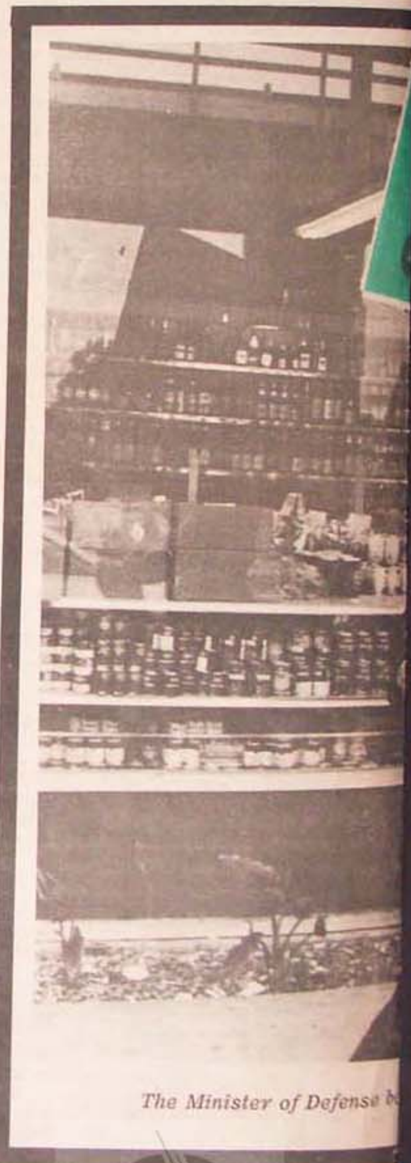
The Minister of Defense

In order to unite the Black community, and in order to establish a positive, complementary economic linkage between the completely destitute and those who have a few pennies, we will first persuade through petition, and through the boycott when necessary. We see very little difference in those Blacks who will make profit off the Black community and refuse to contribute to Black