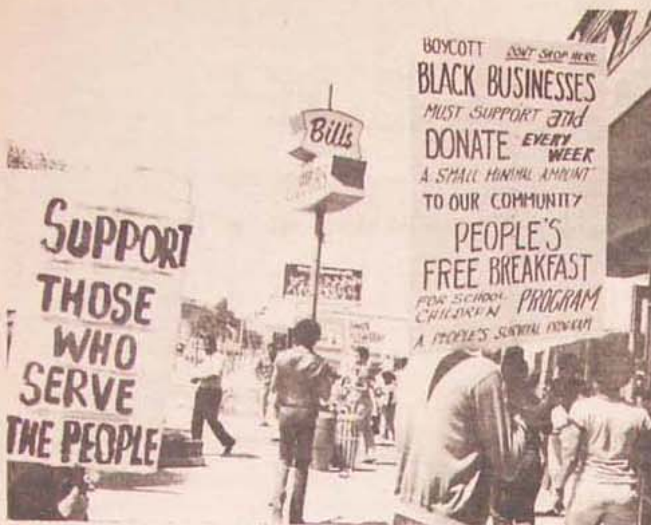
The Community Survival Programs need the support of the Black Businessman.