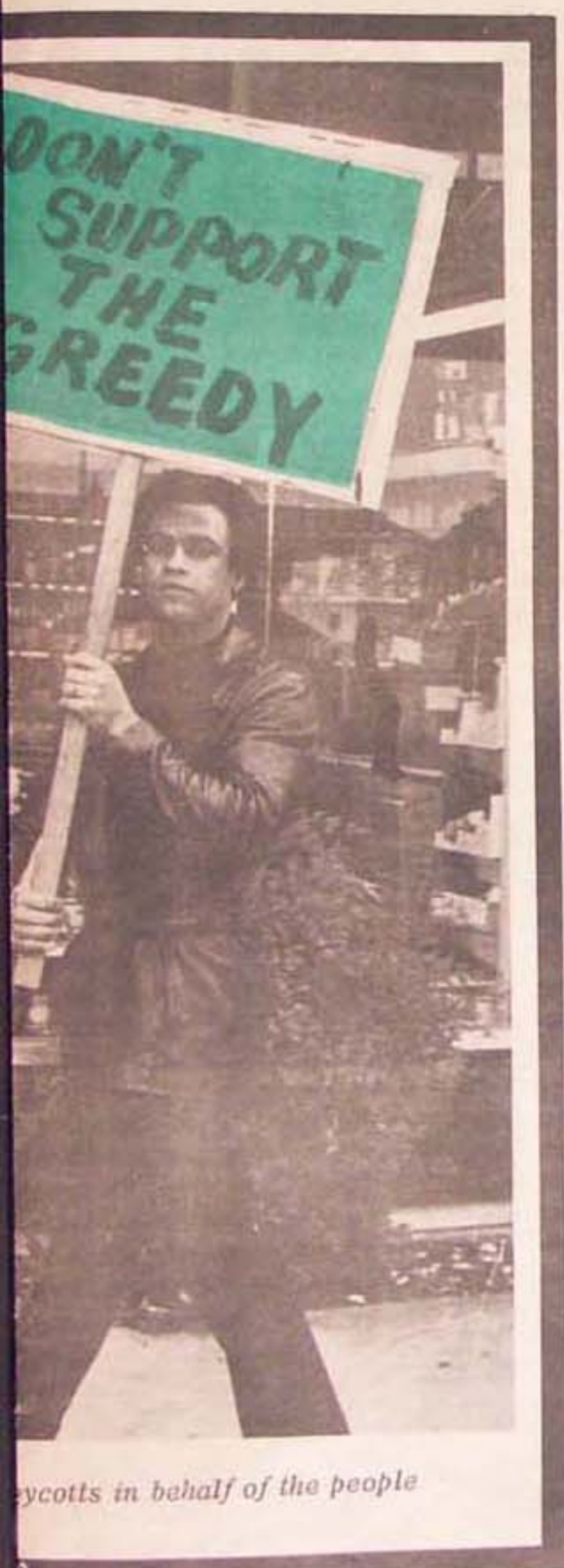
Boycotts in behalf of the people