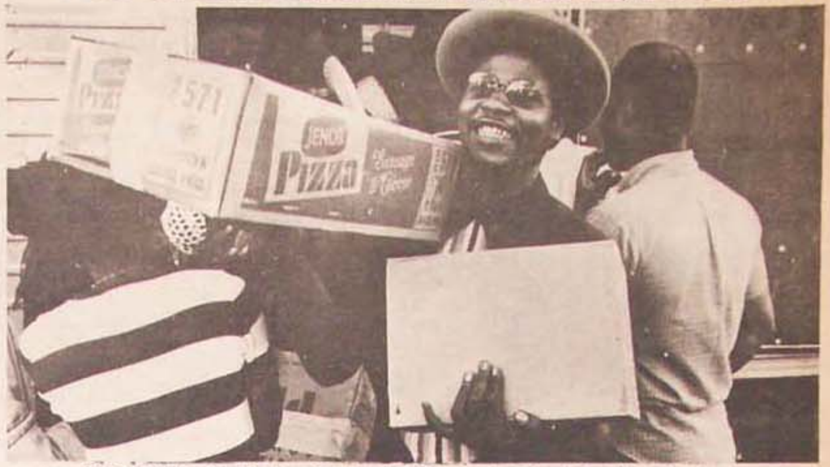
1965, Watts Riot? No, Oakland 1971 -- the Black Panther Party implements the People's Free Food Program