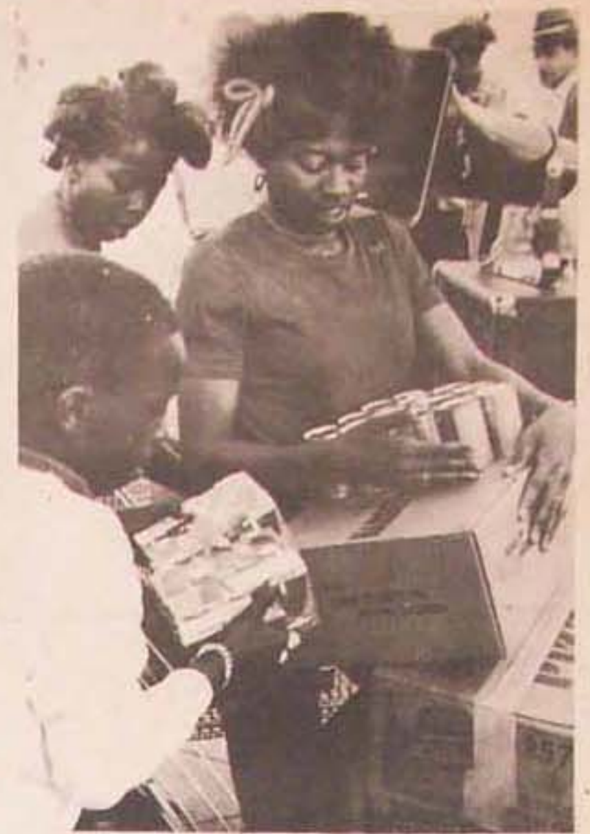
Free food, free clothing, free shoes, etc., etc.

But the free food is there. We want the brothers and sisters, especially the mothers, to come up there and take the boxes with you. And you are going to remember why we're talking about they should donate to the survival programs, a small minimal amount every week. Don't let him jive you talking about he decided to donate, he